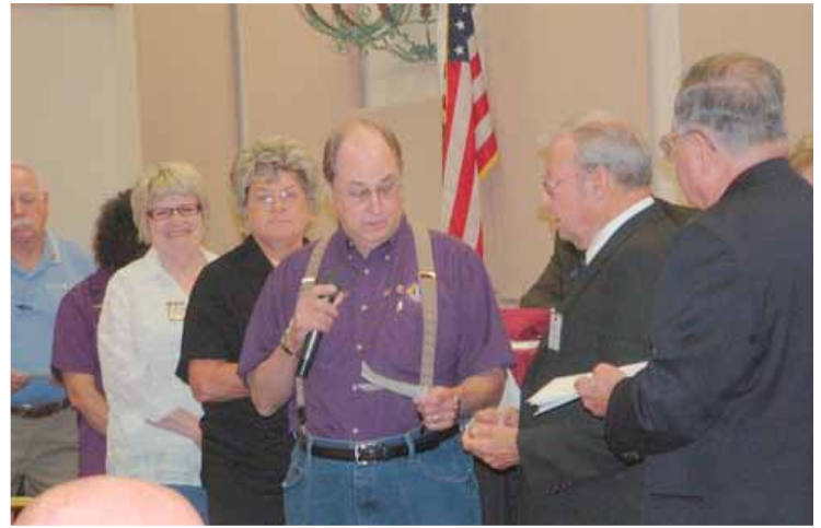
Governor Hugh Stroud makes a contribution to Texas Lions Camp during the parade of checks during the breakfast Saturday morning, August 7, 2010