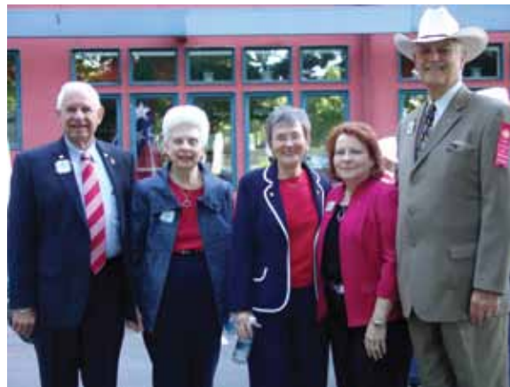
At the parade