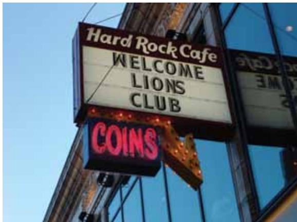
MD-2made a quick stop for dinner.