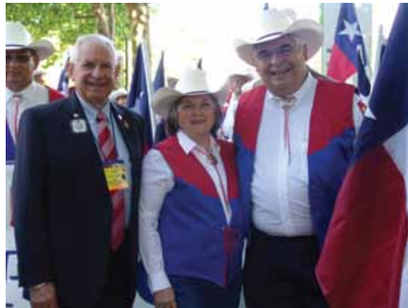
At the parade