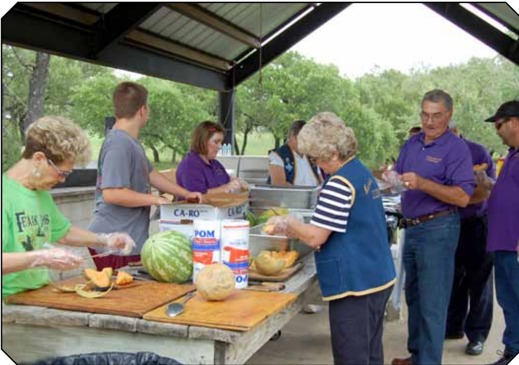
Members of the Vernon Lions Club and the Henrietta Lions Club joined forces to serve watermelon and cantaloupe to campers and staff at the Texas Lions Camp recently. Several of those attending are shown slicing the cold treats as they get ready for hungry campers arrival.

Several members of the Vernon Lions Club and the Henrietta Lions Club and their families traveled to Kerrville on July 9 to serve watermelon and cantaloupe to campers and staff at the Texas Lions Camp. Close to 300 persons were served.